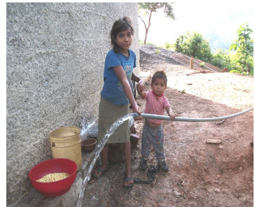
This girl in El Varillal should not have to walk ½ kilometer to wash corn for tortillas. Her family's water tapstand is under

The communities of la Chocolata and El Varillal thank the donors, the municipalities, and Agua Para La Vida for all their support during the execution phase of their project.