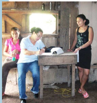
Health promoter doing a Surrey in Rancho Grande.

The community members were quite happy and enthusiastic with the hope that they could soon have safe, clean drinking water in their own homes, leaving behind all the work they have traditionally had to do hauling the water from distant, inaccessible locations