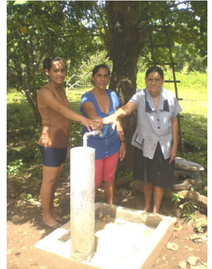
Happy Grandmother, Daughter, and Granddaughter at their water tapstand.

Congratulations to the beneficiaries, for making their dream come true! Surely no Christmas will be as good as this one in Walana.