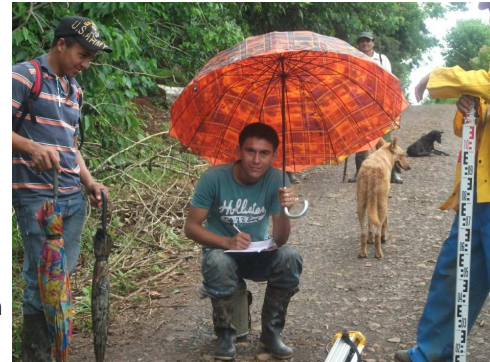
Community members and APLV technicians taking topographical measurements in Nueva Guinea.

APLV has sown hope in these communities. We hope that with your support we can harvest those seeds