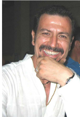
He has arrived!